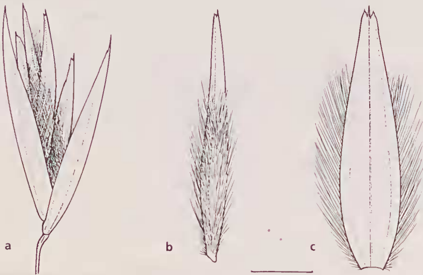
Fig. 2. Triodia tomentosa a, whole spikelet; b, lateral view of lemma; c, adaxial view of lemma. Scale bar = 3 mm for a, = 2 mm for b & c. Drawn from M.G. Corrick 9324 (NSW) by David Mackay.